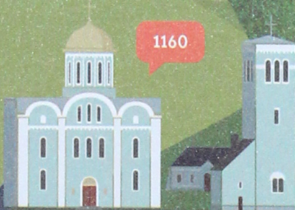
ASSUMPTION CATHEDRAL, VOLODYMYR-VOLYNSKYI