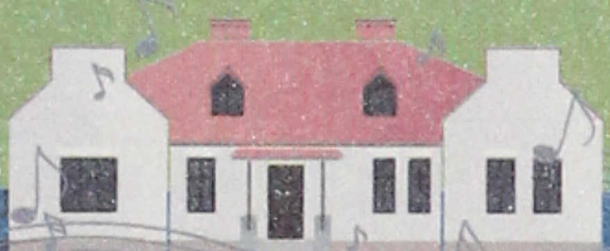
IHOR STRAVINSKYI HOUSE MUSEUM, USTYLUH

"A little paradise for creating" – that's how the great composer described Ustyluh, the town of his youth, which he used to visit every summer from 1893 until 1914