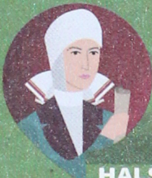
HALSHKA HULEVYCHIVNA (1575–1642)

A Volyn-born noblewoman who founded the Kyiv Brotherhood School, the predecessor of Kyiv-Mohyla Academy, which is now the National University of Kyiv-Mohyla Academy (NaUKMA)