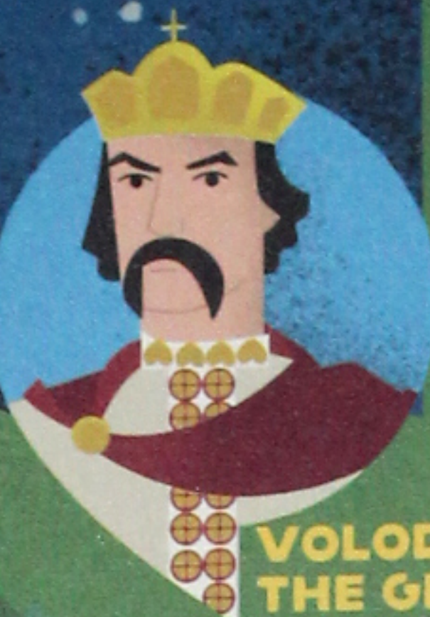
VOLODYMYR THE GREAT (c. 960–1015)

The Grand Prince of Kyiv noticeably extended the boundaries of the ancient Rus state, and was the first Ruthenian prince to mint his own coins