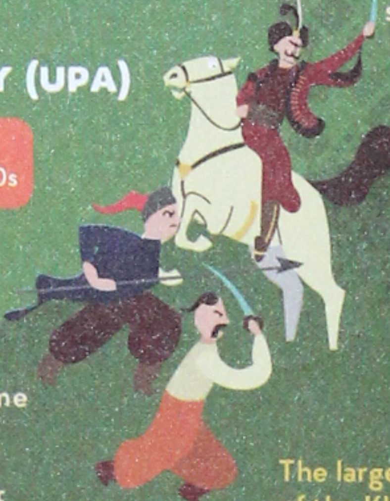
BATTLE OF BERESTECHKO

The largest land battle of the Khmelnytskyi Uprising lasted for nearly two weeks and resulted in the Polish army's defeat of the Khmelnytskyi forces because of their Tatar allies' treason