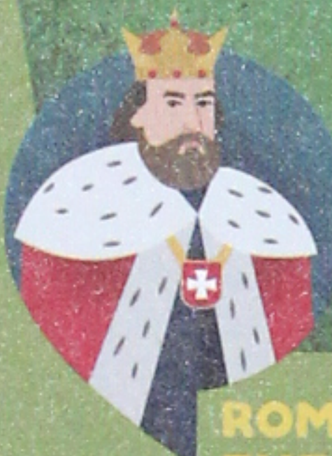
ROMAN THE GREAT (c. 1152–1205)

The founder of the Principality of Galicia-Volhynia – a successor state of Kyivan Rus – once was thought to be the most powerful Rus prince