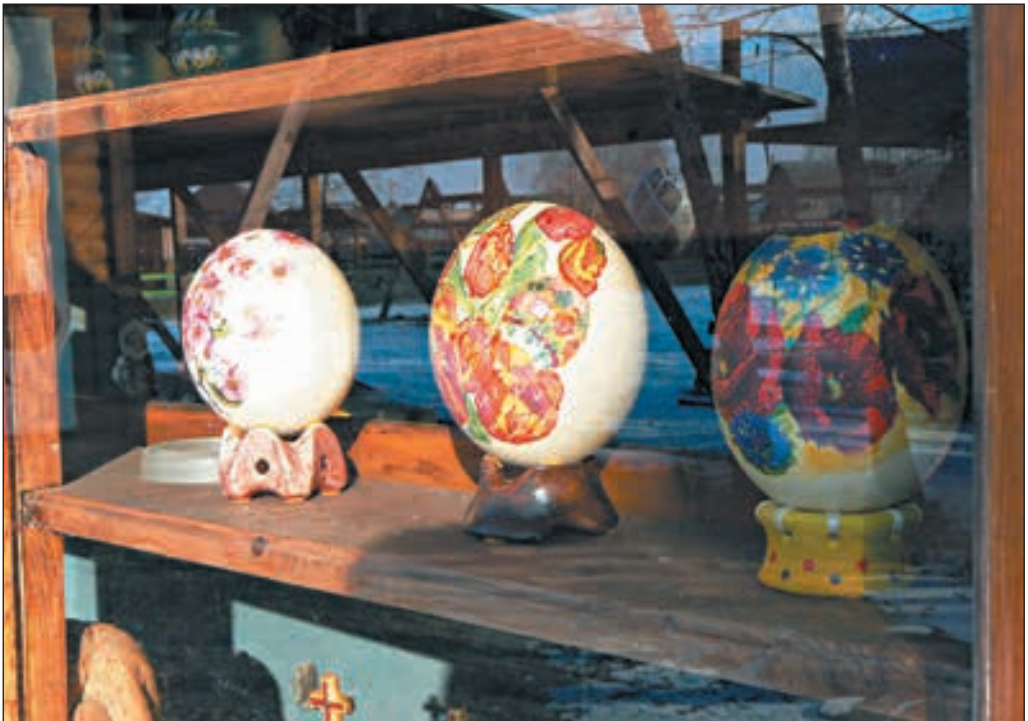
The painted eggs of ostriches are a great souvenir

The shell is not broken but used to make souvenirs — applying decoupage to paint and carve it. A souvenir egg price varies depending on the complexity of work.