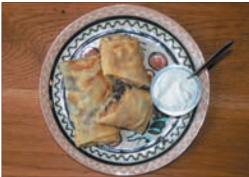
Pancakes with chicken

A folk band singing songs and dancing, as well as a special pancake menu comprising